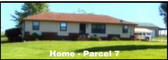
Home - Parcel 7

Exceptional 517 Acre Commercial and Residential Development Property This fabulous 517 acres is one of the best remaining commercial and residential development properties in the region. Strategically located on Hwy. 65 at the EE exit, this property is only 17 miles south of Springfield and 21 miles north of Branson (the next exit south of the new Wal-Mart development at Ozark). Excellent topography for development with 1.3 miles of frontage on Hwy. 65 and excellent visibility. Fully fenced and crossed fenced with numerous improvements, buildings and lakes. Buy one parcel or any combination of parcels up to the entire 517 acres being offered in multi-par. Real estate has proven to be one of the soundest of all investments and will continue to be for years to come. This beautiful and strategically located 517 acre property between Springfield and Branson will be a "Sure Bet" in one of the regions fast growing areas. Our "hats are off" to those of you recognizing investment opportunities such as this one. See you Sale Day!!