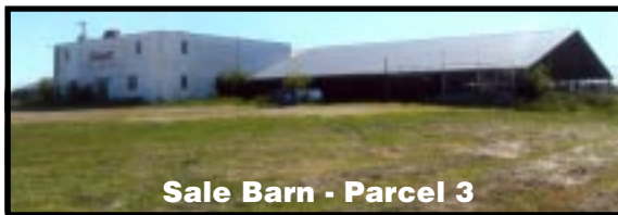
Sale Barn - Parcel 3