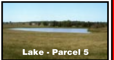
Lake - Parcel 5

JOE B. HOUCHEMS • CHARLIE HILL • JOE B. HOUCHEMS II