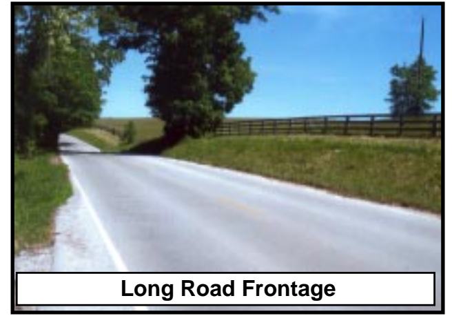
Long Road Frontage